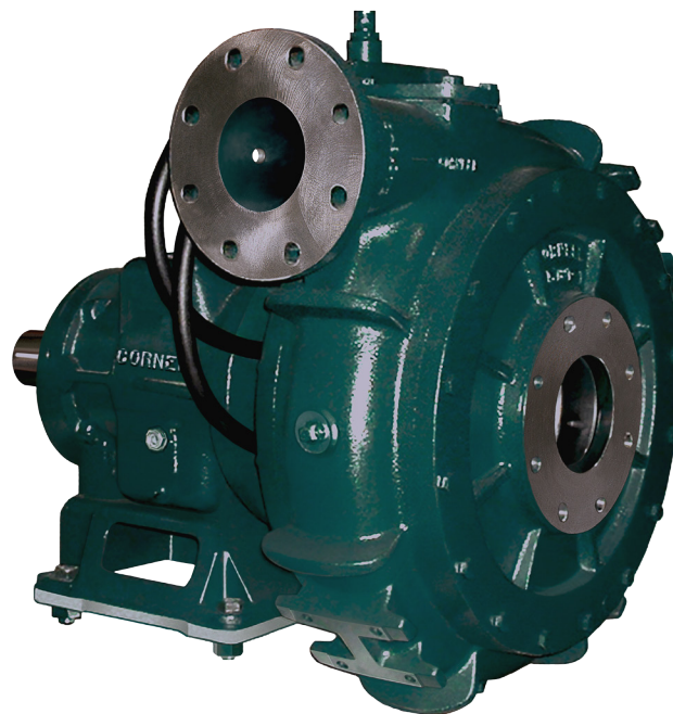
A typical picture of the pump is shown. Please contact Cornell Pump Company for further details. All information is approximate and for general guidance only.