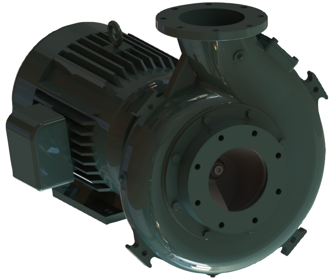
A typical picture of the pump is shown. Please contact Cornell Pump Company for further details. All information is approximate and for general guidance only.